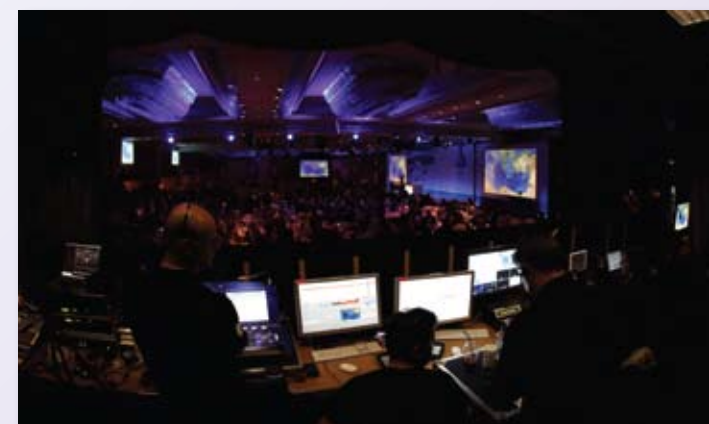
The view from the control box: a strong team behind-the-scenes ensured an ambitious awards gala went without a hitch