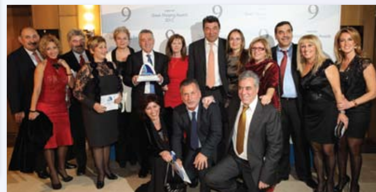
★ THE WINNERS ★ Lloyd's List GREEK SHIPPING AWARDS 2012