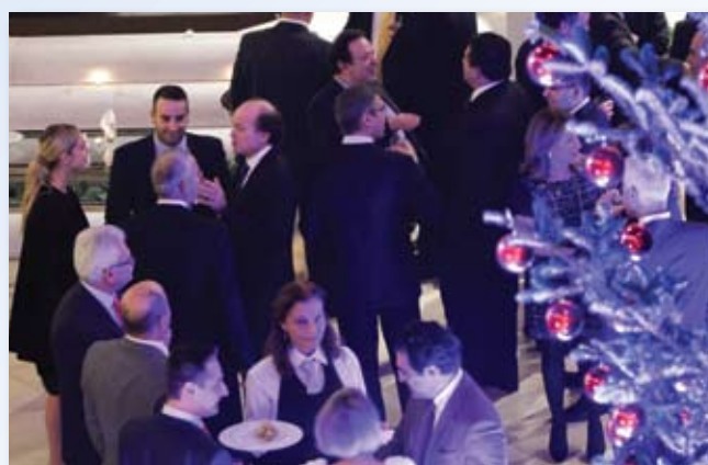
The ABS-hosted cocktail party established a vibrant pre-Christmas mood