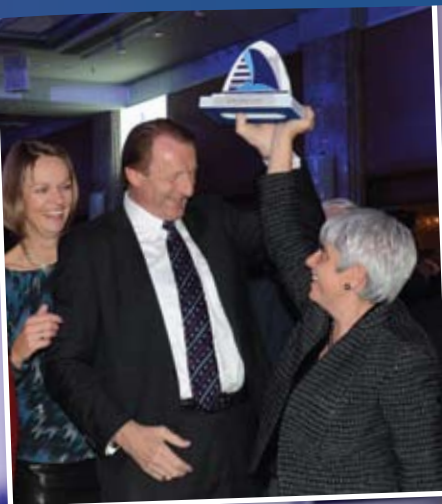
Inset above: Renowned raiser of finance Angeliki Frangou helps raise DVB's Financier of the Year trophy

It's all about the coveted Greek Shipping Awards trophies (right) - but everyone seemed to have a good time, too.